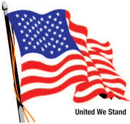
United We Stand